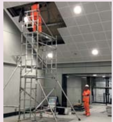
Construction work at the station

Construction challenges have included the watercourse of Walbrook itself. The River Walbrook, from which the Ward of Walbrook gets its name, is one of the City's "lost rivers" and is formed from two tributaries. The first originating in Shoreditch and one from the Barbican. They merge near Finsbury Circus and flow underneath what is now the Bank of England, then running down Walbrook itself underneath the new station entrance to a sewer outlet on the banks of the Thames.