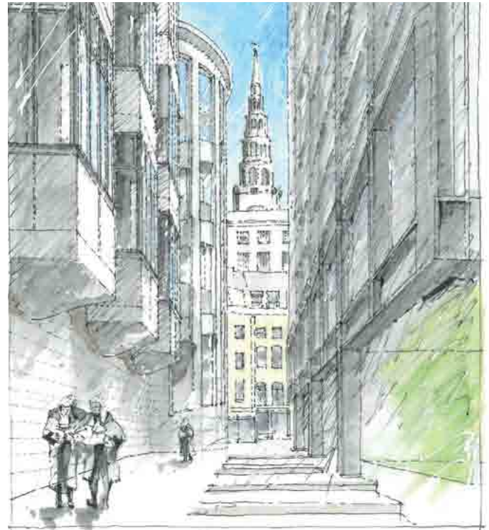
Hanging Sword Damage